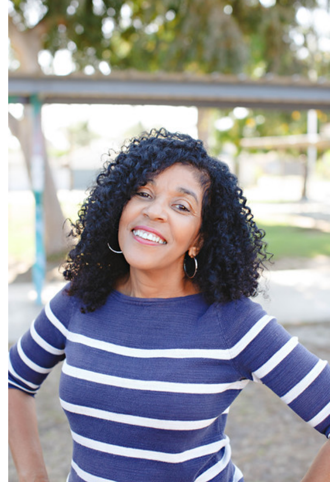
KGB A-K College Counselor