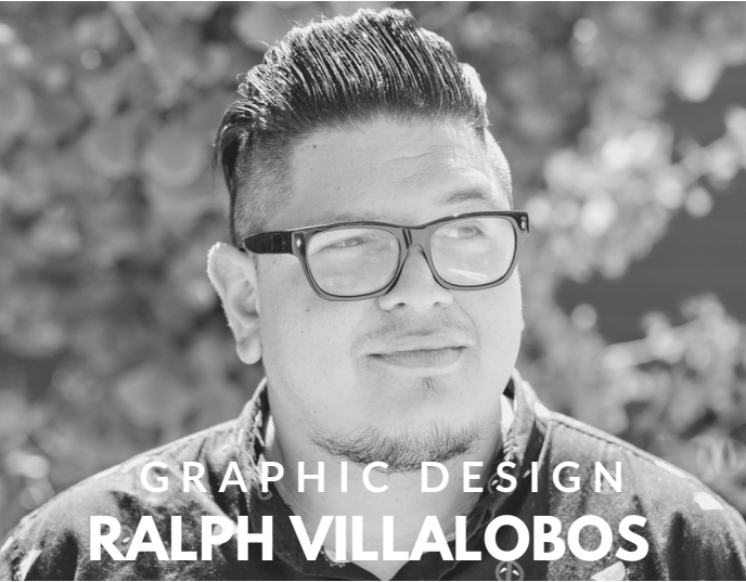
GRAPHIC DESIGN RALPH VILLALOBOS