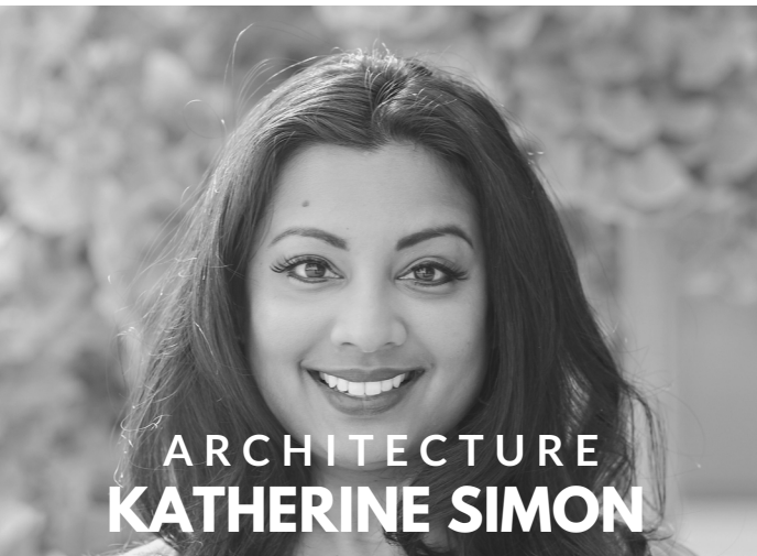
ARCHITECTURE KATHERINE SIMON

This month we are focusing on wrapping up our head study drawings and transitioning into our mask exhibition project. Students will focus on learning Photoshop to create a mood board and mask mock up to prep for mask layout. A large portion of research is done on each students family history and understanding legacy in terms of modern context for each.