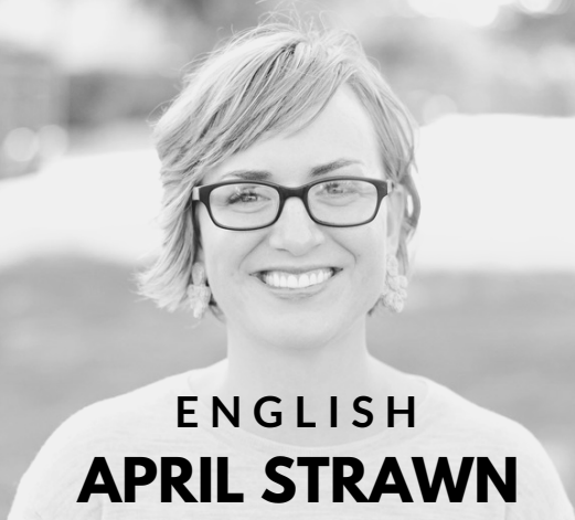
ENGLISH APRIL STRAWN

For March, students are designing and creating an escape room for Exhibition! The English portion of the room is focused on building vocabulary puzzles, pitching, and integrating those puzzles.