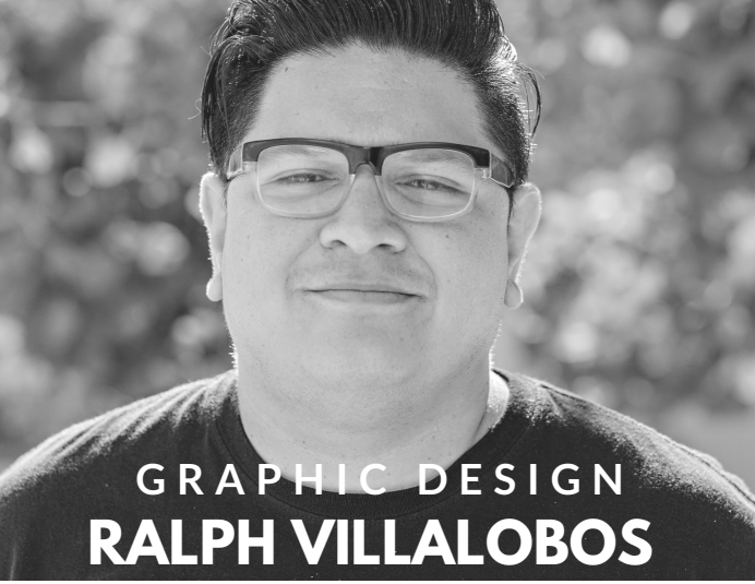
GRAPHIC DESIGN RALPH VILLALOBOS