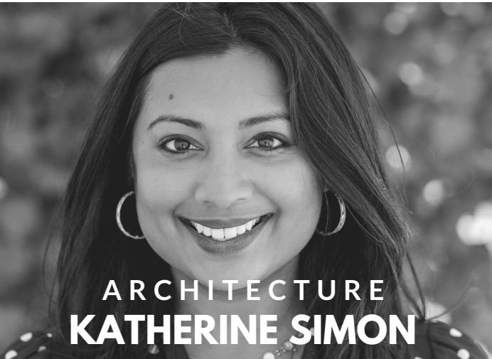
ARCHITECTURE KATHERINE SIMON

Students in Intermediate Graphic Design will be focusing on character design that will eventually be geared for our next major unit, animation. The students will take part in a series of drawing tutorials meant to teach them the basics of head and figure construction. In these tutorials, students will focus on formulas used to subdivide the body and torso with the intent of marking major points of focus in features from the nose, eyes, and lips referencing both figures from life as well as memory. Their POL will focus on these studies used in part with an original concept design of their own.