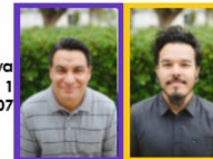
Patrick Hidalgo Art & Design 2 Room 208